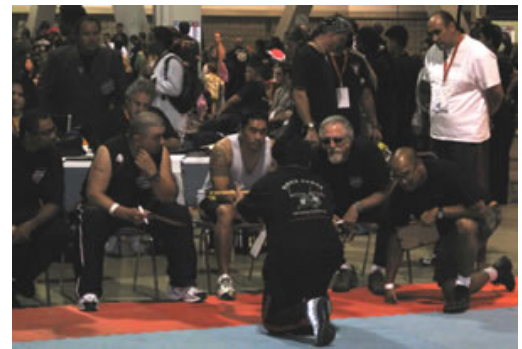
USFMAF and WEKAF conferring on forms competition

Filipino martial arts once again had very large showing, with nine divisions of competition and fighters in every one of them. Athletes had the ability to try out just about any Filipino martial arts weapon divisions that could be offered. Comradery was well spread in this tournament whether competitor, volunteer or spectator. WEKAF and USFMAF judges joined together in the forms divisions.