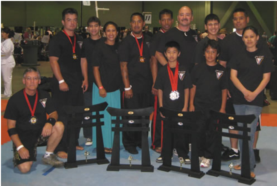
South Bay Filipino Martial Arts Club