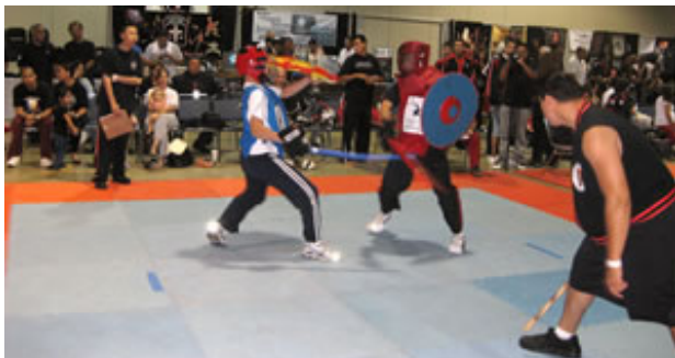
Mike Cultural Challenge

The Cultural Challenge was really something with strikes from padded weapons so had that they broke shields wood and the fancy foam-rubber types too. I saw some of the non- Filipino martial arts helmets crack and faces masked dented in. It really pays to have good equipment. I was really glad we use quality